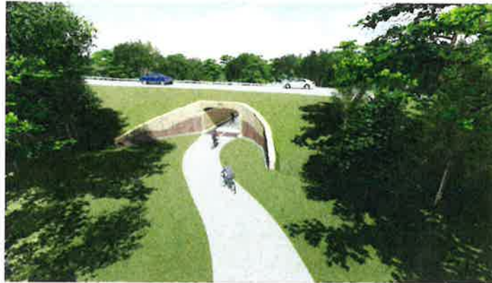
Tunnel Concept East View of Tunnel